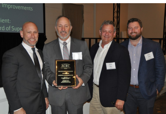
Compton Engineering, Inc. Project: Linea Dock Bulkhead Improvements