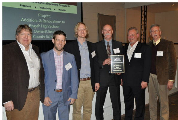
Laird + Smithers, Inc. and Burns Cooley Dennis, Inc. Project: Additions & Renovations to Pisgah High School