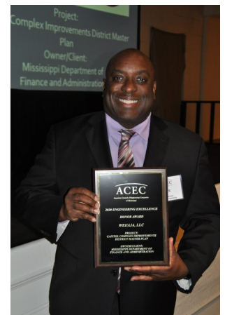
WEI/AJA, LLC Project: Capitol Com- plex Improvements District Master Plan