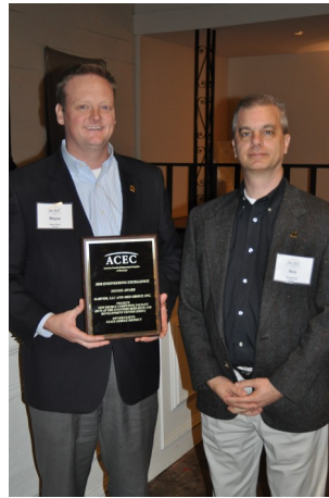
Garver, LLC and MES Group, Inc. Project: Traffic Flow at the ERDC Project: New Secure Com- puting Facility at the ERDC