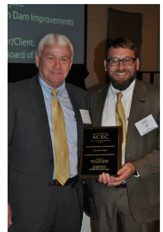
Michael Baker International Project: Spring Lake Earthen Dam Improvements