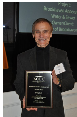
WGK, Inc. Project: Brookhaven Annexation Water & Sewer