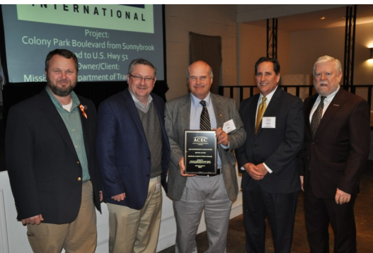
Michael Baker International Project: Colony Park Boulevard From Sunnybrook Road to U.S. Hwy 51