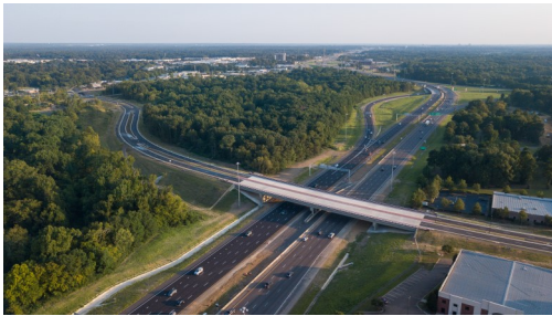
Lake Harbour Drive Project Waggoner Engineering, Inc.

This year’s Engineering Excellence Awards Ceremony will be taped in advance and uploaded on our website. Due to COVID-19 concerns, we will not be having an awards banquet. An email will be sent out to inform all members when it will be uploaded to our website (acecms.org). Our Annual Assembly will be held via Zoom.