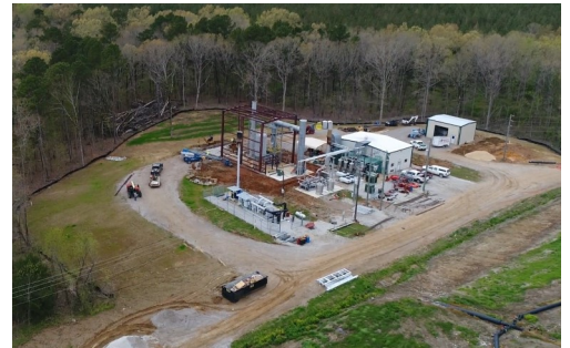
Three Rivers Solid Waste Management Authority Landfill Leachate Evaporator Project—FC&E Engineering, LLC and Mid-South Consulting, Quality Engineering Solutions