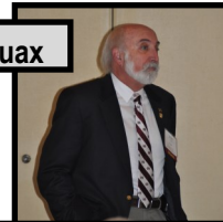
MSU CEE Department